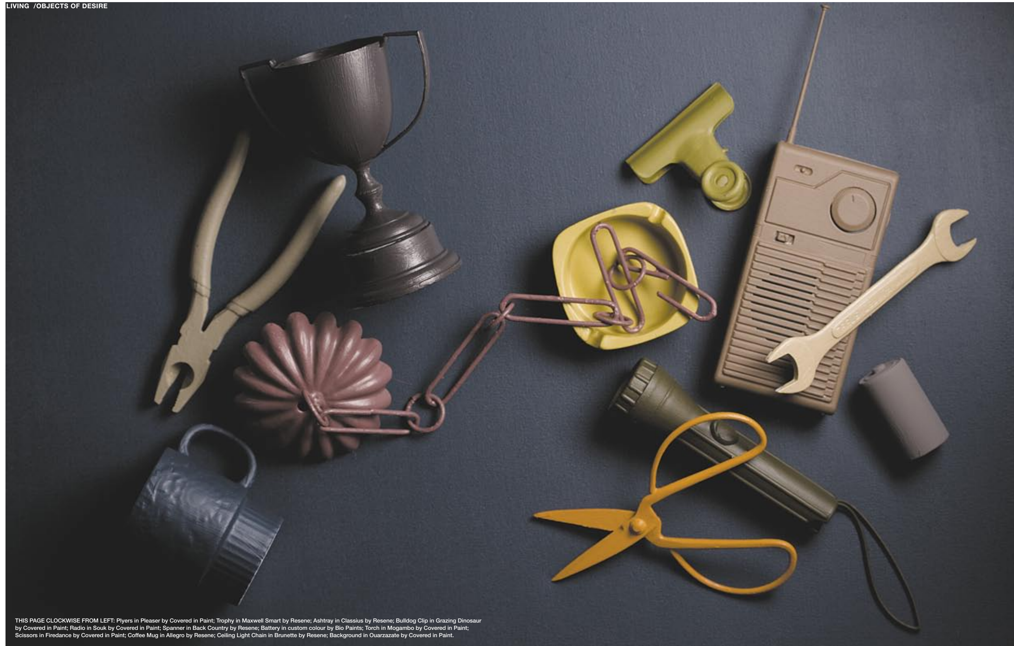
THIS PAGE CLOCKWISE FROM LEFT: Pliers in Pleaser by Covered in Paint; Trophy in Maxwell Smart by Resene; Ashtray in Classius by Resene; Bulldog Clip in Grazing Dinosaur by Covered in Paint; Radio in Souk by Covered in Paint; Spanner in Back Country by Resene; Battery in custom colour by Bio Paints; Torch in Mogambo by Covered in Paint; Scissors in Firedance by Covered in Paint; Coffee Mug in Allegro by Resene; Ceiling Light Chain in Brunette by Resene; Background in Ouarzazate by Covered in Paint.