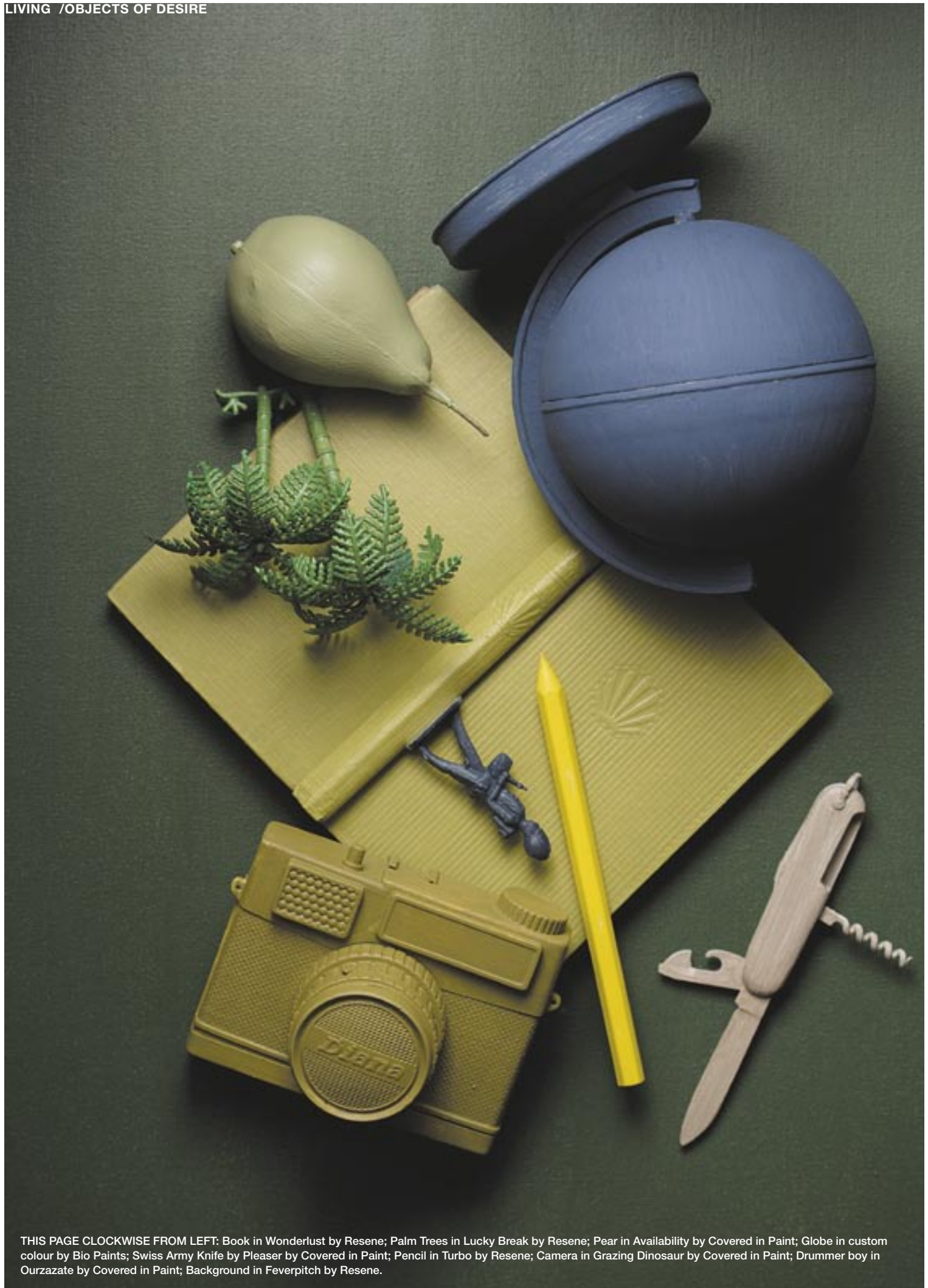
THIS PAGE CLOCKWISE FROM LEFT: Book in Wonderlust by Resene; Palm Trees in Lucky Break by Resene; Pear in Availability by Covered in Paint; Globe in custom colour by Bio Paints; Swiss Army Knife by Pleaser by Covered in Paint; Pencil in Turbo by Resene; Camera in Grazing Dinosaur by Covered in Paint; Drummer boy in Ourzazate by Covered in Paint; Background in Feverpitch by Resene.